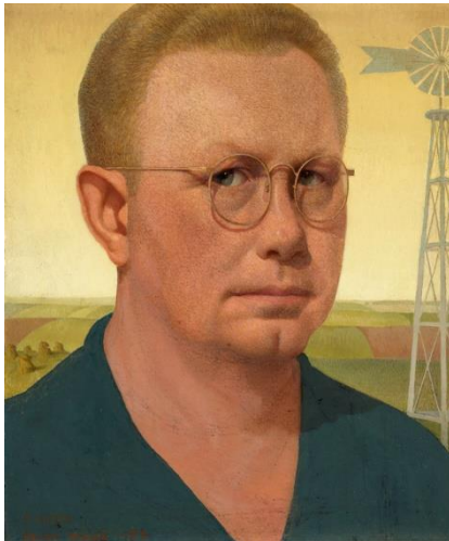
Grant Wood American, 1891-1942 Self-portrait, 1932-1941 Oil on Masonite Figge Art Museum, City of Davenport Art Collection, Grant Wood Archive, Friends of Art Acquisition Fund, 1965.1