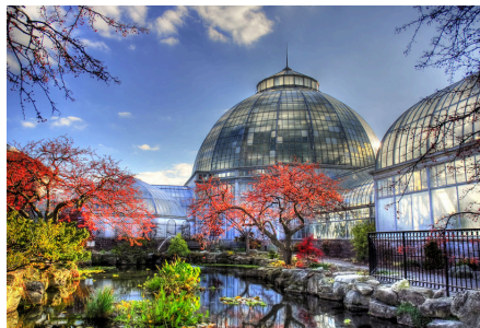
Belle Isle Park and Conservatory