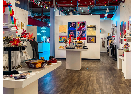
Detroit Artists Market