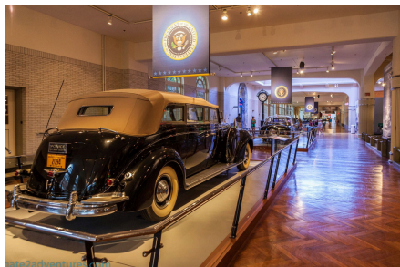
Henry Ford Museum