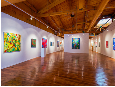
N'Namdi Center for Contemporary Art