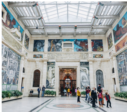
Detroit Institute of Arts