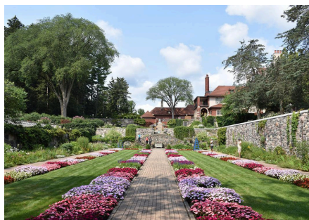
Cranbrook House and Gardens