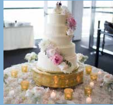
Wedding images by JM Photo Chicago