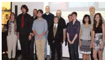
2015 Brand Boeshaar Scholarship winners

Portfolio Deadline: Friday March 4 and Saturday, March 5