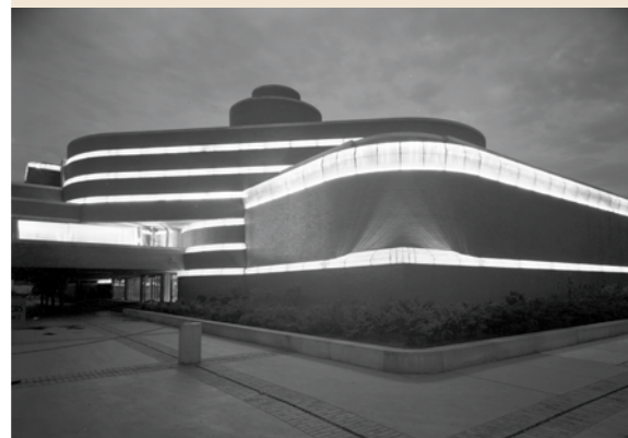
Johnson Wax headquarters, Racine, Wisconsin