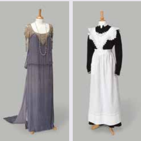
Downton Abbey costumes courtesy of Cosprop

Museum members are invited to join us on our spring trip to Chicago, where everyone will find something to love through the combination of Downton Abbey and Van Gogh. Participants will start the day exploring the Art Institute, featuring a special exhibition Van Gogh's Bedrooms , and others, including Van Dyck, Rembrandt, and the Portrait Print and Supernatural Shakespeare . Later, guests will shop Michigan Avenue and visit the Driehaus Museum for a viewing of the fantastic exhibition featuring costumes from the wildly popular TV series Downton Abbey: Dressing Downton™: Changing Fashion for Changing Times .